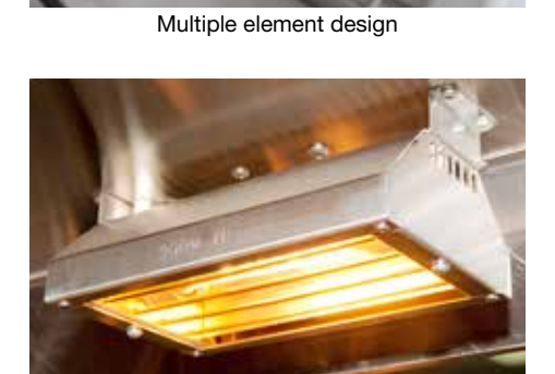
Quartz infra-red overhead heat lamps