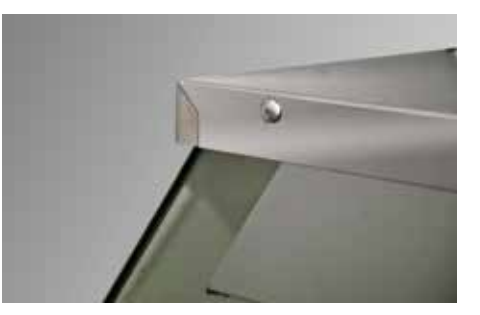
Fully sealed toughened glass

Having no front stainless steel supports, the straight glass profile display allows for maximum visibility of chosen product.